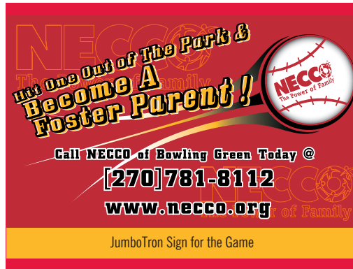
JumboTron Sign for the Game